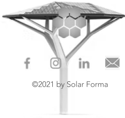
E-Cacia 22 ft