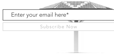
E-Cacia 17 ft

Attachment: E-CACIA - Solar Tree _ Solar Forma Design (7574 : Discuss E-Cacia Solar Tree (Referred by Alderperson Wagner))