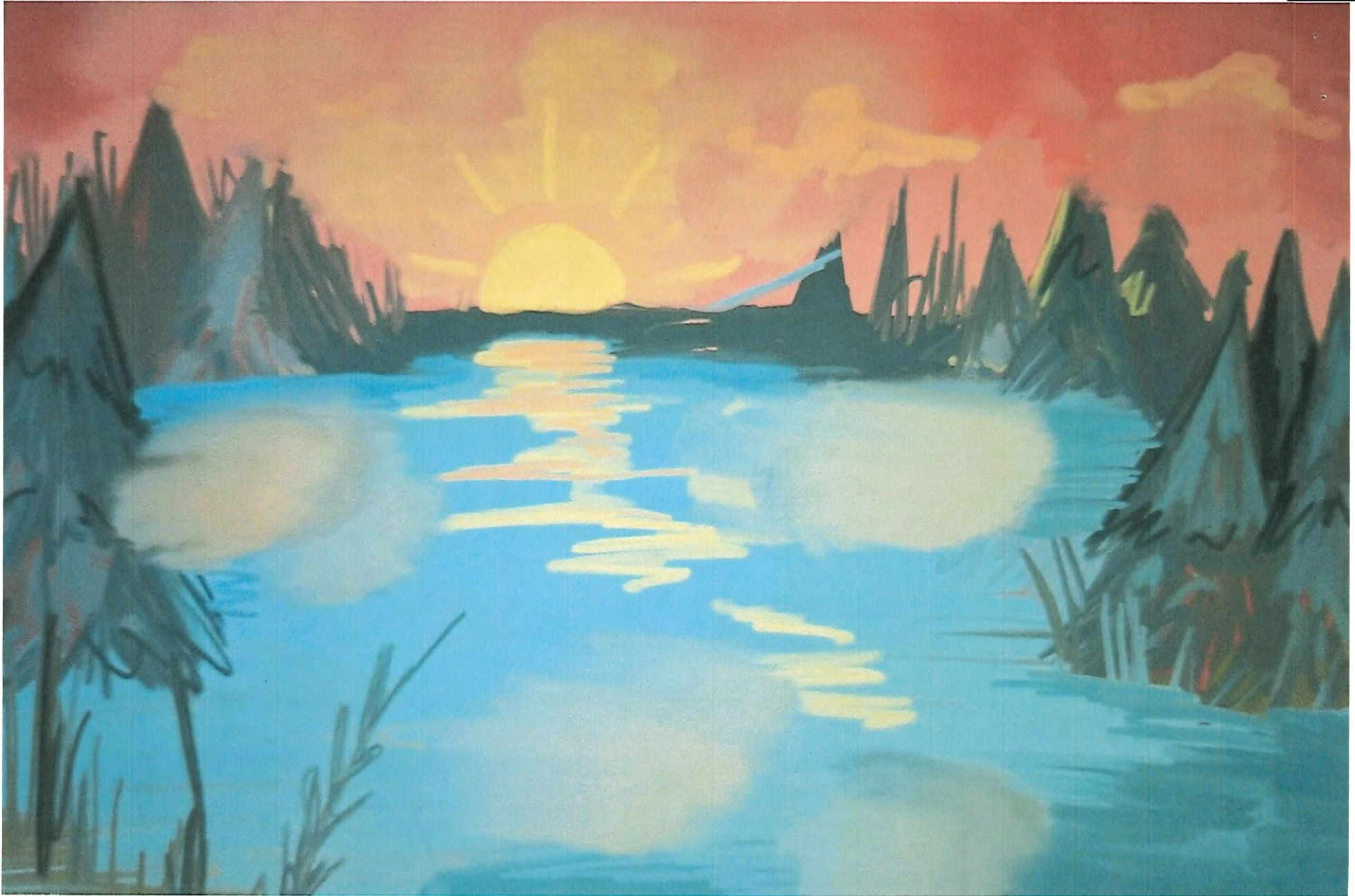
Attachment: Public Arts Committee - Schroeder's Gift Barn Mural Proposal (6853 : Schroeder's Gift Barn